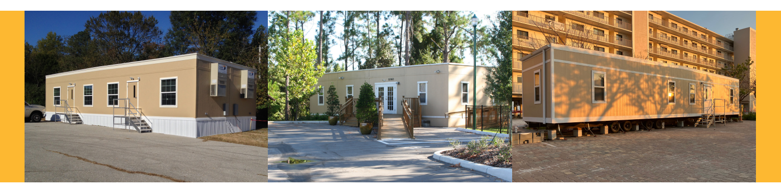
Mobile Offices Sales Offices Portable Buildings